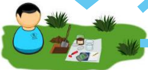
Goal 1: EU-Wide Soil Monitoring