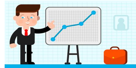
Main elements of the EUSO FORUM