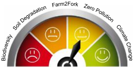
Goal 2: Monitoring of soil related policies