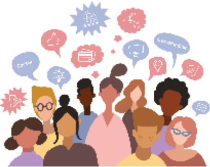
Goal 4: Provide an European Soil Forum