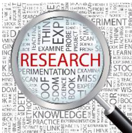
Goal 3: Support to Research & Innovation